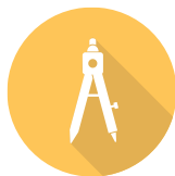
ENGINEERS & PLANNERS

As proud members of both the Housing Industry Association (HIA) and the Boating Industry Association (BIA), we are committed to the highest standards of excellence. We work only with premium quality materials that have excellent resistance to seawater damage, corrosion, thermal cycling, wet rot, fungi and marine borer attacks. Our project managers are capable of tackling unique and tough situations while completing projects under budget and under time.